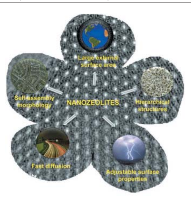
Fig. 1. The structural properties of nano-zeolite